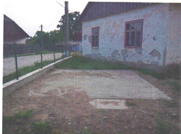
Latitude: N 47°54.830' (47°54'49.8"), Longitude: E 25°39.251' (25°39'15.1"), Altitude (Barometer): 445.00m