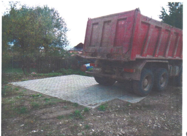
Latitude: N 47°48.096' (47°48'5.7"), Longitude: E 26°0.024' (26°0'1.5"), Altitude (Barometer): 175.00m