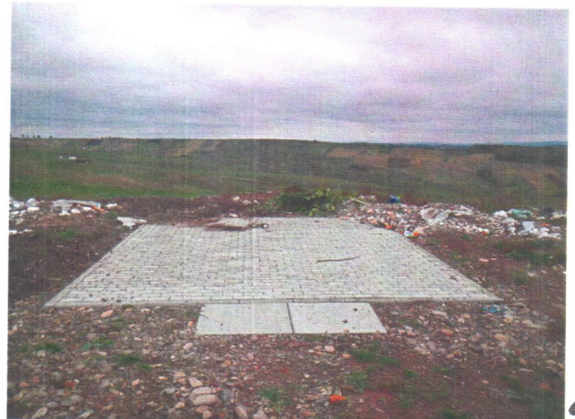
Latitude: N 47°53.923' (47°53'55.4"), Longitude: E 26°5.995' (26°5'59.7"), Altitude (Barometer): 275.00m