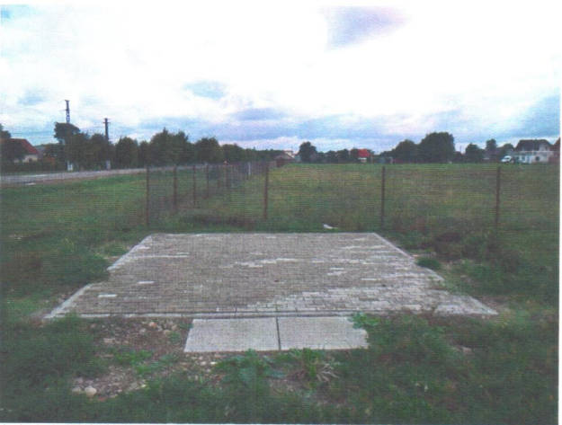
Latitude: N 47°48.522' (47°48'31.3"), Longitude: E 25°58.157' (25°58'9.4"), Altitude (Barometer): 200.00m