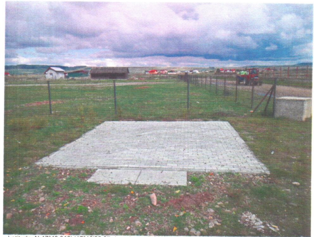
Latitude: N 47°46.919' (47°46'55.2"), Longitude: E 26°0.762' (26°0'45.7"), Altitude (Barometer): 168.00m