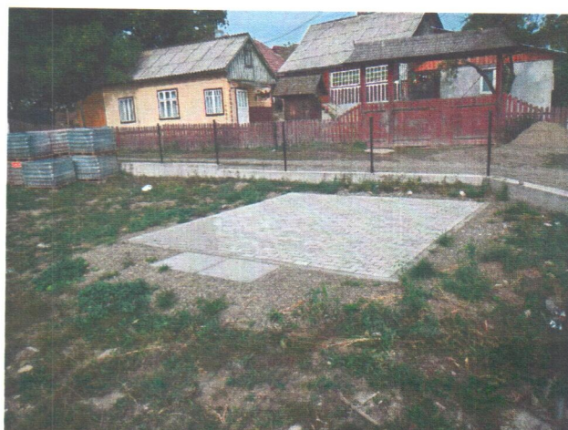
Latitude: N 47°55.611' (47°55'36.6"), Longitude: E 25°37.254' (25°37'15.2"), Altitude (Barometer): 447.00m