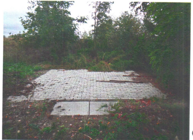
Latitude: N 47°55.377' (47°55'22.6"), Longitude: E 26°4.796' (26°4'47.8"), Altitude (Barometer): 227.00m