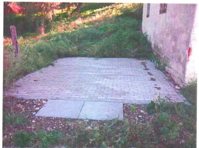
Latitude: N 47°51.393' (47°51'23.6"), Longitude: E 26°7.042' (26°7'2.5"), Altitude (Barometer): 302.00m