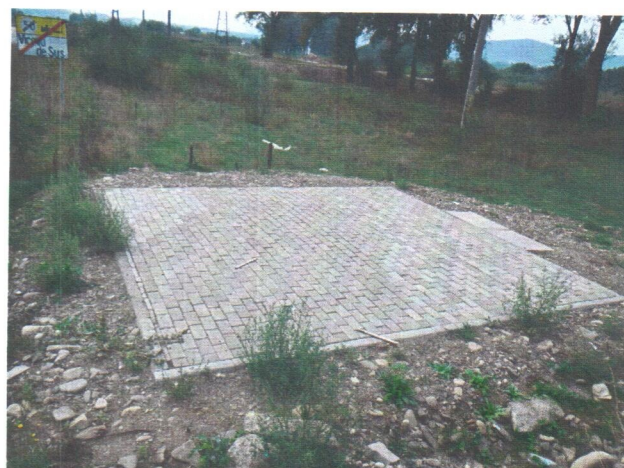
Latitude: N 47°54.813' (47°54'48.8"), Longitude: E 25°42.484' (25°42'29.0"), Altitude (Barometer): 422.00m