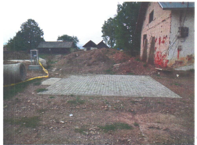
Latitude: N 47°54.760' (47°54'45.6"), Longitude: E 25°49.467' (25°49'28.0"), Altitude (Barometer): 370.00m