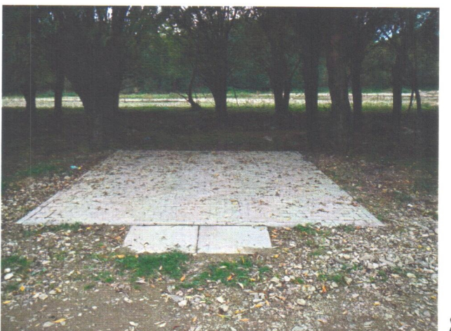
Latitude: N 47°48.310' (47°48'18.6"), Longitude: E 25°59.201' (25°59'12.1"), Altitude (Barometer): 187.00m