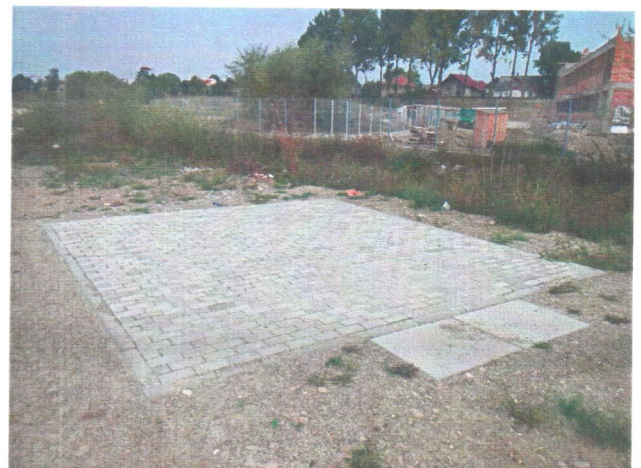
Latitude: N 47°55.516' (47°55'31.0"), Longitude: E 25°39.487' (25°39'29.2"), Altitude (Barometer): 424.00m