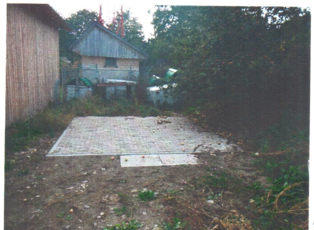
Latitude: N 47°52.277' (47°52'16.6"), Longitude: E 25°36.713' (25°36'42.8"), Altitude (Barometer): 527.00m