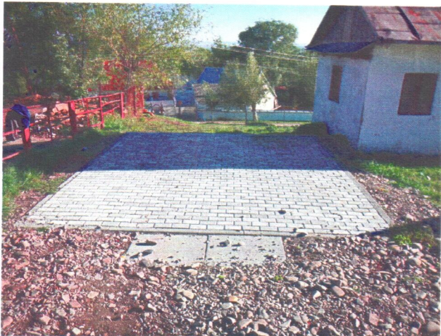
Latitude: N 47°52.502' (47°52'30.1"), Longitude: E 26°6.179' (26°6'10.7"), Altitude (Barometer): 286.00m