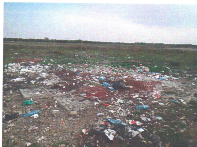
Latitude: N 47°54.796' (47°54'47.8"), Longitude: E 25°40.679' (25°40'40.8"), Altitude (Barometer): 430.00m