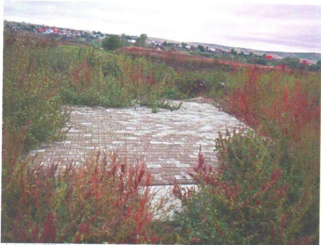
Latitude: N 47°53.428' (47°53'25.7"), Longitude: E 26°3.711' (26°3'42.7"), Altitude (Barometer): 220.00m