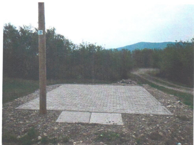
Latitude: N 47°55.358' (47°55'21.5"), Longitude: E 25°37.498' (25°37'29.9"), Altitude (Barometer): 444.00m