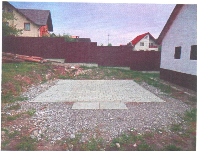
Latitude: N 47°55.129' (47°55'7.7"), Longitude: E 25°42.119' (25°42'7.1"), Altitude (Barometer): 423.00m