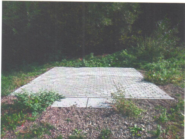
Latitude: N 47°53.971' (47°53'58.3"), Longitude: E 25°35.840' (25°35'50.4"), Altitude (Barometer): 488.00m