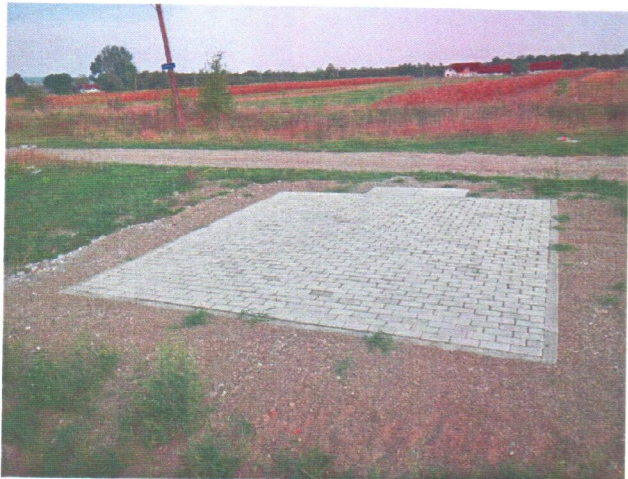
Latitude: N 47°54.840' (47°54'50.4"), Longitude: E 25°38.661' (25°38'39.7"), Altitude (Barometer): 456.00m