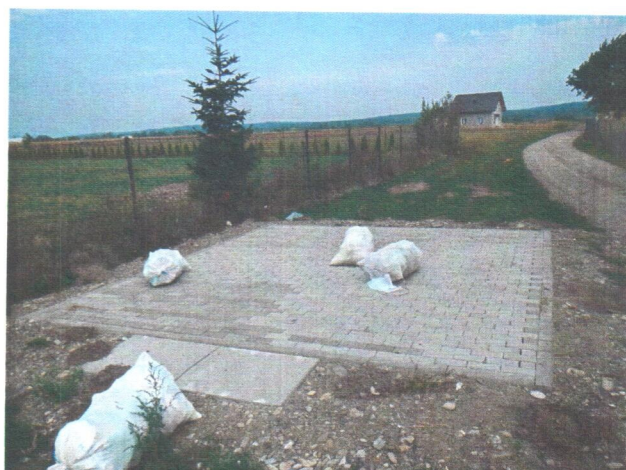
Latitude: N 47°55.937' (47°55'56.2"), Longitude: E 25°40.528' (25°40'31.7"), Altitude (Barometer): 439.00m