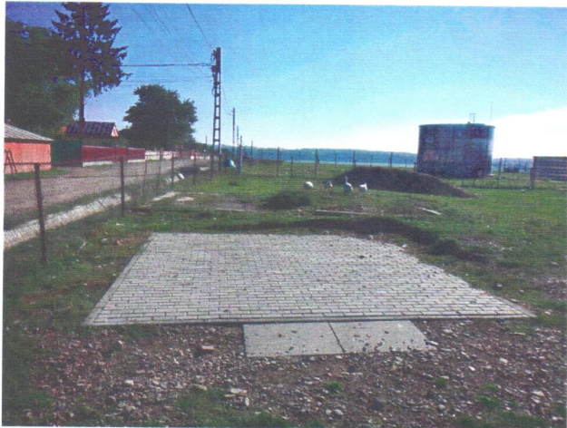
Latitude: N 47°51.415' (47°51'24.9"), Longitude: E 26°7.645' (26°7'38.7"), Altitude (Barometer): 352.00m