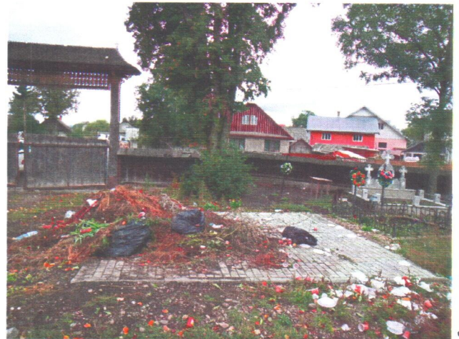
Latitude: N 47°48.015' (47°48'0.9"), Longitude: E 25°59.929' (25°59'55.7"), Altitude (Barometer): 189.00m