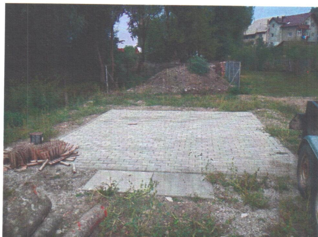
Latitude: N 47°55.339' (47°55'20.4"), Longitude: E 25°40.191' (25°40'11.4"), Altitude (Barometer): 429.00m