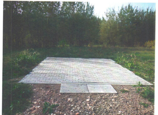
Latitude: N 47°52.858' (47°52'51.5"), Longitude: E 25°37.076' (25°37'4.5"), Altitude (Barometer): 501.00m