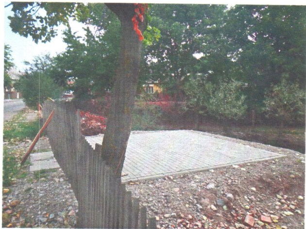
Latitude: N 47°55.684' (47°55'41.1"), Longitude: E 25°38.426' (25°38'25.5"), Altitude (Barometer): 442.00m