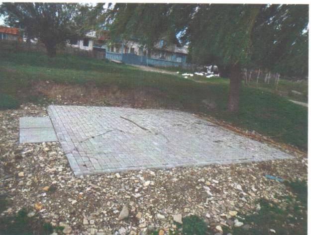
Latitude: N 47°48.964' (47°48'57.8"), Longitude: E 25°57.847' (25°57'50.8"), Altitude (Barometer): 197.00m