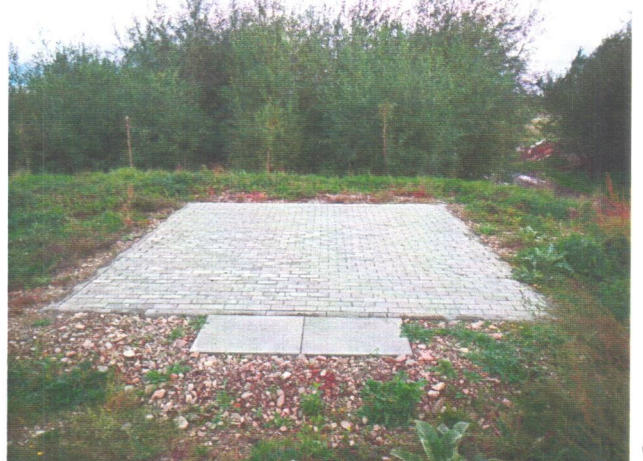
Latitude: N 47°48.645' (47°48'38.7"), Longitude: E 25°58.314' (25°58'18.9"), Altitude (Barometer): 188.00m