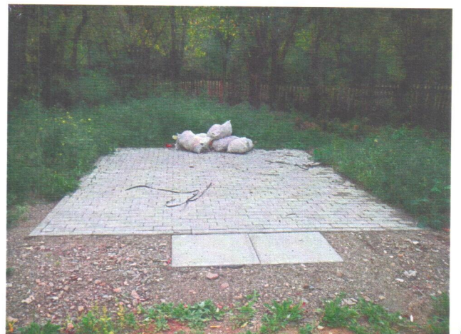
Latitude: N 47°55.833' (47°55'50.0"), Longitude: E 25°35.918' (25°35'55.1"), Altitude (Barometer): 462.00m