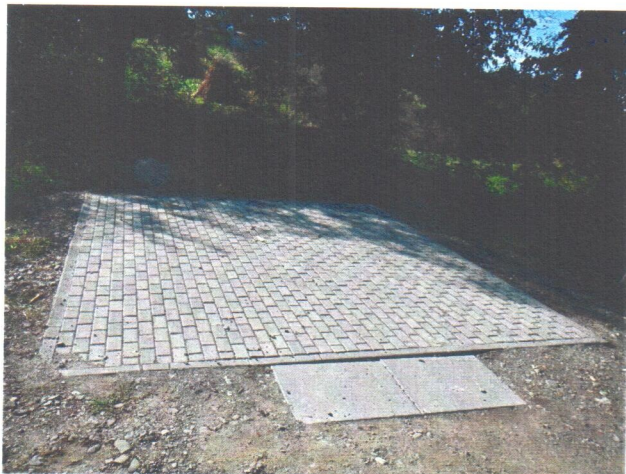
Latitude: N 47°51.181' (47°51'10.8"), Longitude: E 26°6.915' (26°6'54.9"), Altitude (Barometer): 269.00m