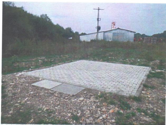
Latitude: N 47°55.210' (47°55'12.6"), Longitude: E 25°40.874' (25°40'52.5"), Altitude (Barometer): 425.00m