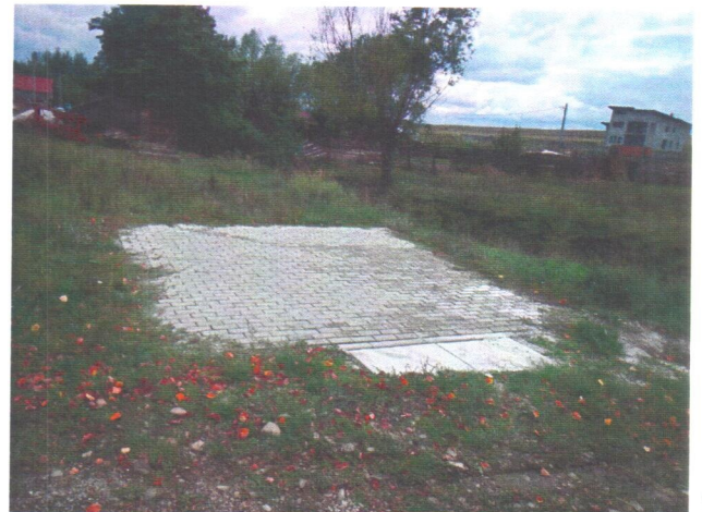
Latitude: N 47°46.703' (47°46'42.2"), Longitude: E 26°0.210' (26°0'12.6"), Altitude (Barometer): 182.00m