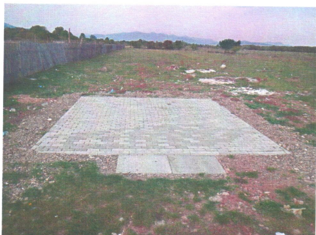
Latitude: N 47°54.987' (47°54'59.2"), Longitude: E 25°39.330' (25°39'19.8"), Altitude (Barometer): 441.00m