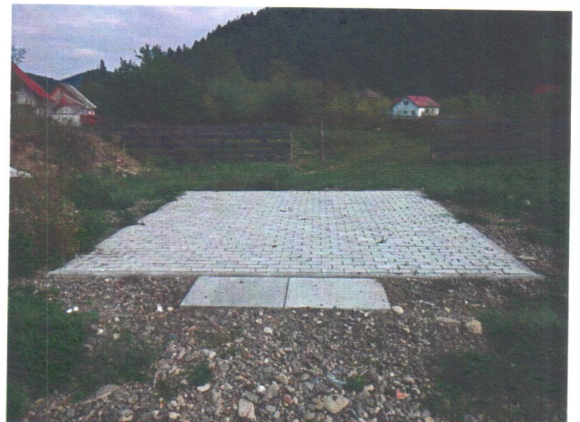
Latitude: N 47°51.898' (47°51'53.9"), Longitude: E 25°36.427' (25°36'25.6"), Altitude (Barometer): 529.00m