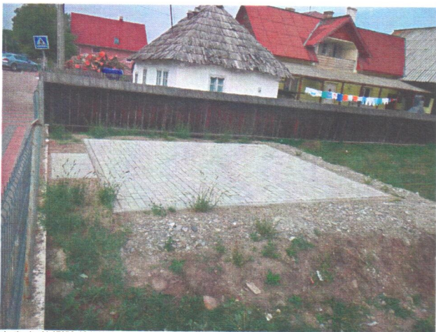
Latitude: N 47°56.134' (47°56'8.0"), Longitude: E 25°38.360' (25°38'21.6"), Altitude (Barometer): 450.00m