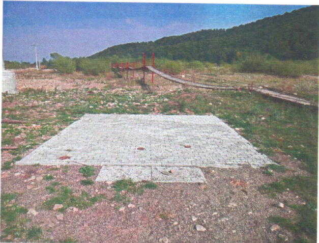
Latitude: N 47°54.040' (47°54'2.4"), Longitude: E 25°36.439' (25°36'26.4"), Altitude (Barometer): 478.00m