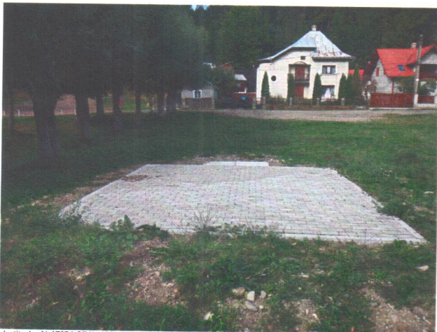
Latitude: N 47°51.871' (47°51'52.3"), Longitude: E 25°37.142' (25°37'8.5"), Altitude (Barometer): 529.00m