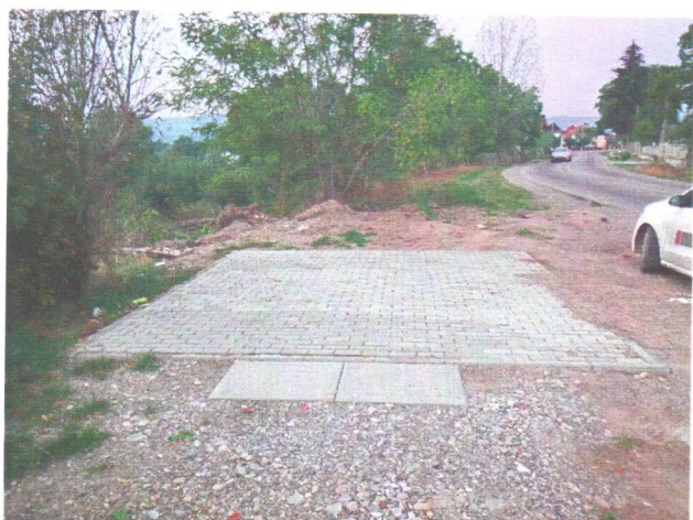
Latitude: N 47°55.631' (47°55'37.9"), Longitude: E 25°39.106' (25°39'6.4"), Altitude (Barometer): 440.00m