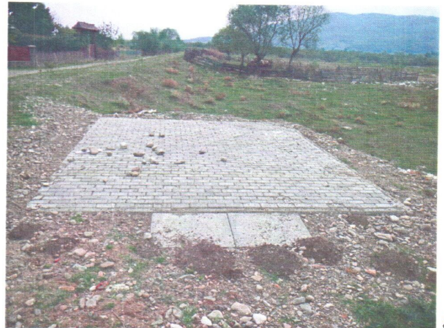
Latitude: N 47°55.317' (47°55'19.0"), Longitude: E 25°36.353' (25°36'21.2"), Altitude (Barometer): 454.00m