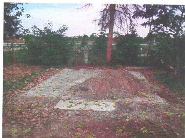
Latitude: N 47°54.661' (47°54'39.7"), Longitude: E 25°39.605' (25°39'36.3"), Altitude (Barometer): 442.00m