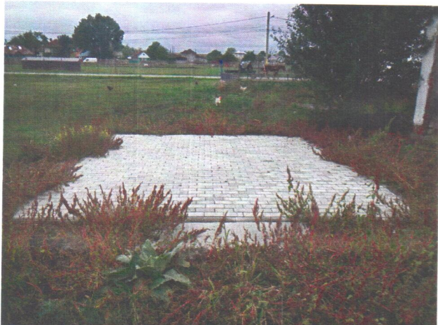
Latitude: N 47°55.255' (47°55'15.3"), Longitude: E 26°4.687' (26°4'41.2"), Altitude (Barometer): 228.00m