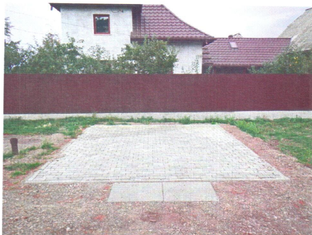
Latitude: N 47°55.651' (47°55'39.1"), Longitude: E 25°39.336' (25°39'20.2"), Altitude (Barometer): 440.00m