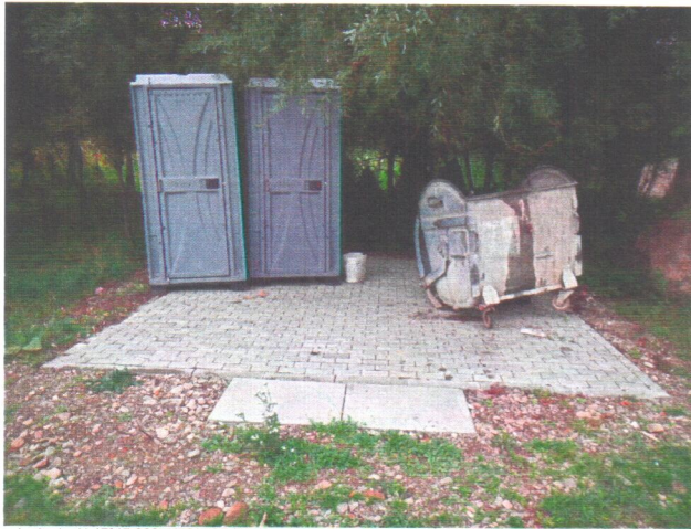
Latitude: N 47°47.622' (47°47'37.3"), Longitude: E 26°0.084' (26°0'5.0"), Altitude (Barometer): 177.00m