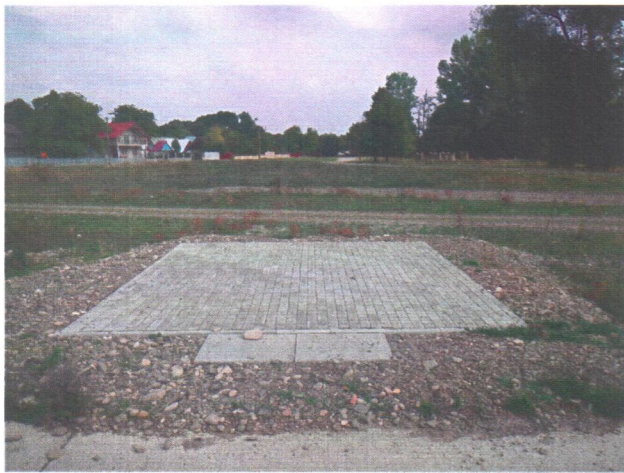
Latitude: N 47°55.015' (47°55'0.9"), Longitude: E 25°48.901' (25°48'54.1"), Altitude (Barometer): 370.00m