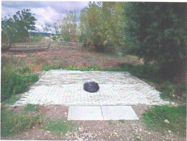
Latitude: N 47°46.438' (47°46'26.3"), Longitude: E 26°1.226' (26°1'13.6"), Altitude (Barometer): 164.00m