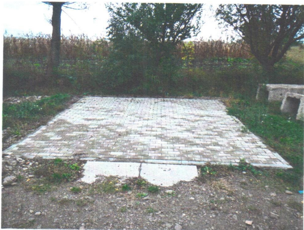
Latitude: N 47°55.534' (47°55'32.0"), Longitude: E 26°4.118' (26°4'7.1"), Altitude (Barometer): 232.00m