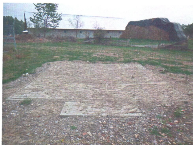
Latitude: N 47°55.561' (47°55'33.7"), Longitude: E 25°38.833' (25°38'50.0"), Altitude (Barometer): 435.00m