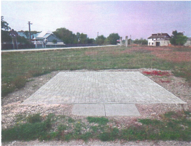
Latitude: N 47°54.798' (47°54'47.9"), Longitude: E 25°47.452' (25°47'27.1"), Altitude (Barometer): 382.00m