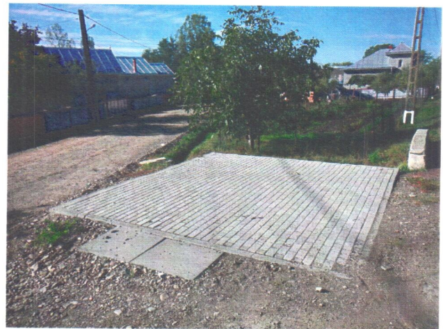
Latitude: N 47°51.142' (47°51'8.5"), Longitude: E 26°6.421' (26°6'25.3"), Altitude (Barometer): 251.00m