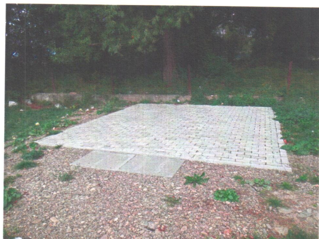
Latitude: N 47°55.330' (47°55'19.8"), Longitude: E 25°40.316' (25°40'19.0"), Altitude (Barometer): 429.00m