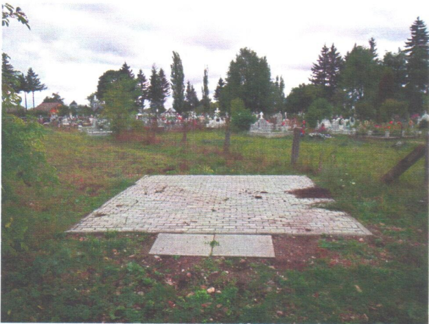
Latitude: N 47°47.921' (47°47'55.3"), Longitude: E 25°59.914' (25°59'54.8"), Altitude (Barometer): 189.00m