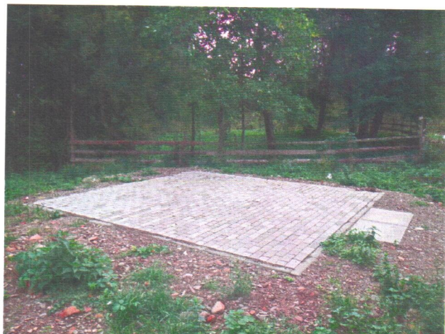
Latitude: N 47°55.106' (47°55'6.4"), Longitude: E 25°41.520' (25°41'31.2"), Altitude (Barometer): 423.00m