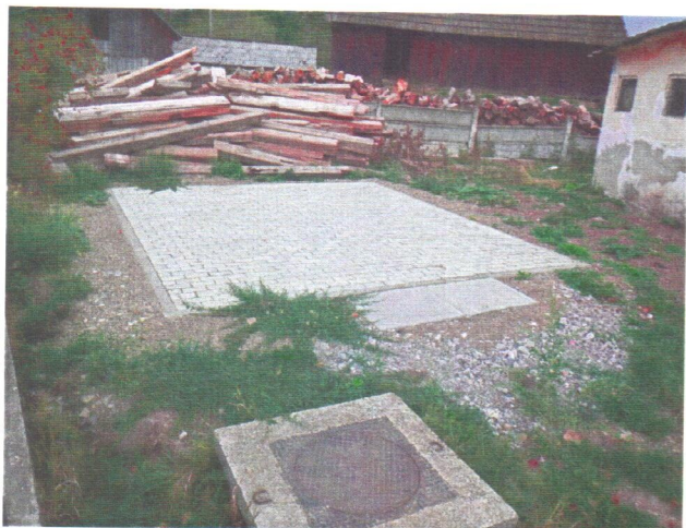
Latitude: N 47°55.594' (47°55'35.7"), Longitude: E 25°39.539' (25°39'32.4"), Altitude (Barometer): 441.00m