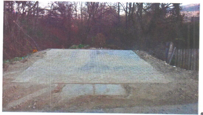
Latitude: ---, Longitude: ---, Altitude: ---