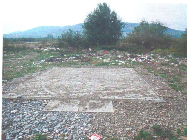
Latitude: N 47°55.470' (47°55'28.2"), Longitude: E 25°38.246' (25°38'14.7"), Altitude (Barometer): 439.00m