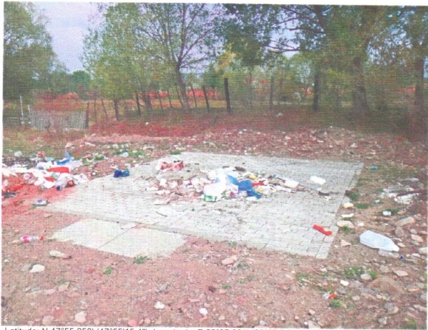
Latitude: N 47°55.258' (47°55'15.4"), Longitude: E 25°37.001' (25°37'0.0"), Altitude (Barometer): 447.00m