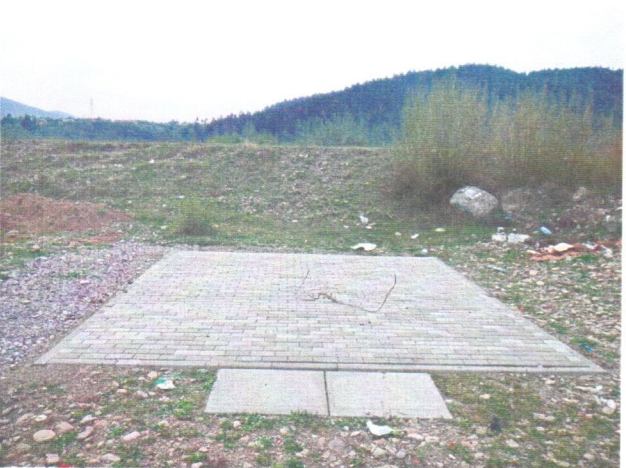
Latitude: N 47°55.219' (47°55'13.2"), Longitude: E 25°35.785' (25°35'47.1"), Altitude (Barometer): 455.00m