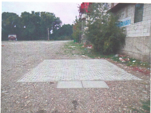
Latitude: N 47°55.328' (47°55'19.7"), Longitude: E 25°40.404' (25°40'24.3"), Altitude (Barometer): 428.00m