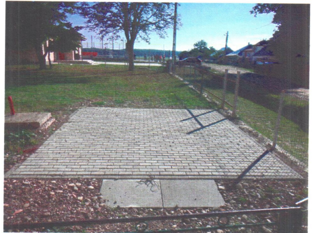
Latitude: N 47°51.276' (47°51'16.5"), Longitude: E 26°7.609' (26°7'36.5"), Altitude (Barometer): 351.00m