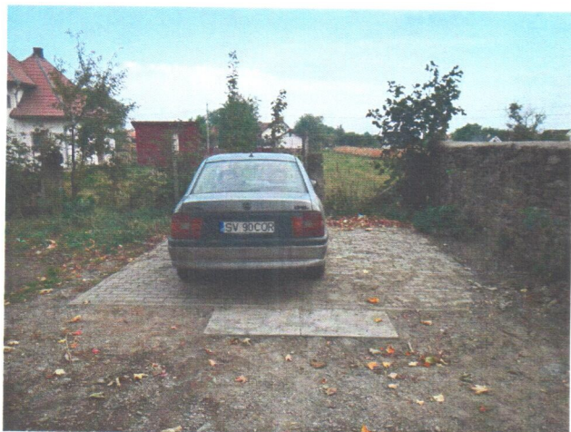
Latitude: N 47°55.470' (47°55'28.2"), Longitude: E 25°40.423' (25°40'25.4"), Altitude (Barometer): 431.00m