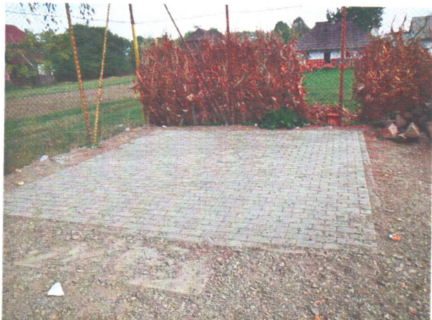
Latitude: N 47°54.810' (47°54'48.6"), Longitude: E 25°40.366' (25°40'22.0"), Altitude (Barometer): 438.00m