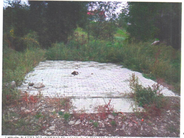
Latitude: N 47°53.207' (47°53'12.4"), Longitude: E 26°4.109' (26°4'6.5"), Altitude (Barometer): 207.00m