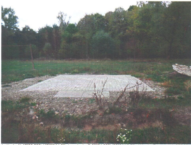
Latitude: N 47°55.239' (47°55'14.3"), Longitude: E 25°51.325' (25°51'19.5"), Altitude (Barometer): 357.00m