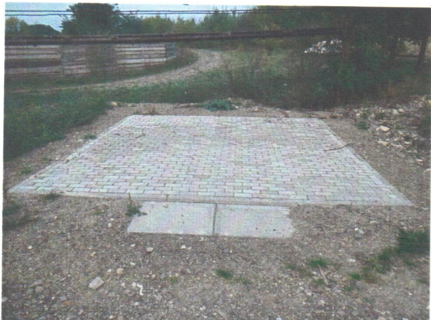
Latitude: N 47°54.760' (47°54'45.6"), Longitude: E 25°41.342' (25°41'20.5"), Altitude (Barometer): 424.00m